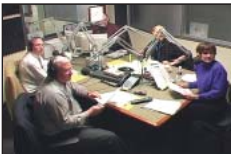
2003 IFWF/IDFG Radio Auction