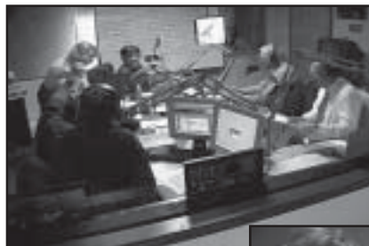
Hosts in the control room review the latest radio auction bids.